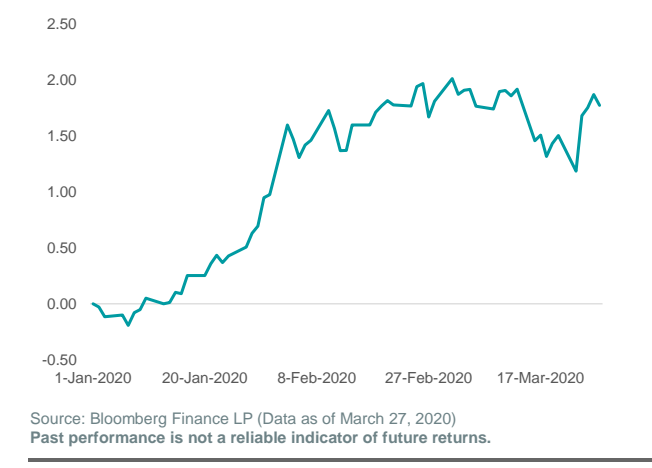
FIGURE 2. MSCI USA ESG LOW CARBON INDEX PERFORMANCE VSPARENT BENCHMARK

We also see some interesting trends when we look at fund flows. As the virus spread from Asia to Europe and then the U.S., fund flows have moved out of Europe and the U.S. and now, as confidence is slowing returning to Asian markets, inflows are moving back into China and Japan.<sup>6</sup> This tallies with relative equity market performance where we have seen the Chinese equity market outperforming other markets in March.<sup>7</sup>